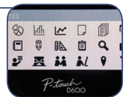
14 fonts ; 99 frames Over 600 symbols