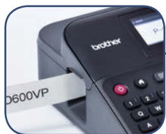
Automatic label cutter