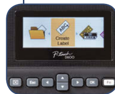
High-resolution colour display