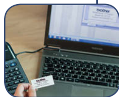
Prints labels from your PC or Mac