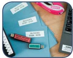
Print labels 6 – 24mm in width

Connect to your PC or Mac and be creative by using various fonts, text styles, images and frames on your label design. You can even link to text contained in a Microsoft Excel spreadsheet to quickly print many labels at once, thanks to its high-speed print capabilities and fully automatic cutter.