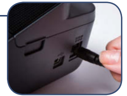
Uses 6 x AA batteries* or included AC adapter