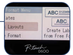
Built-in editable label designs