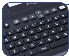
Easy-to-type PC-style keyboard